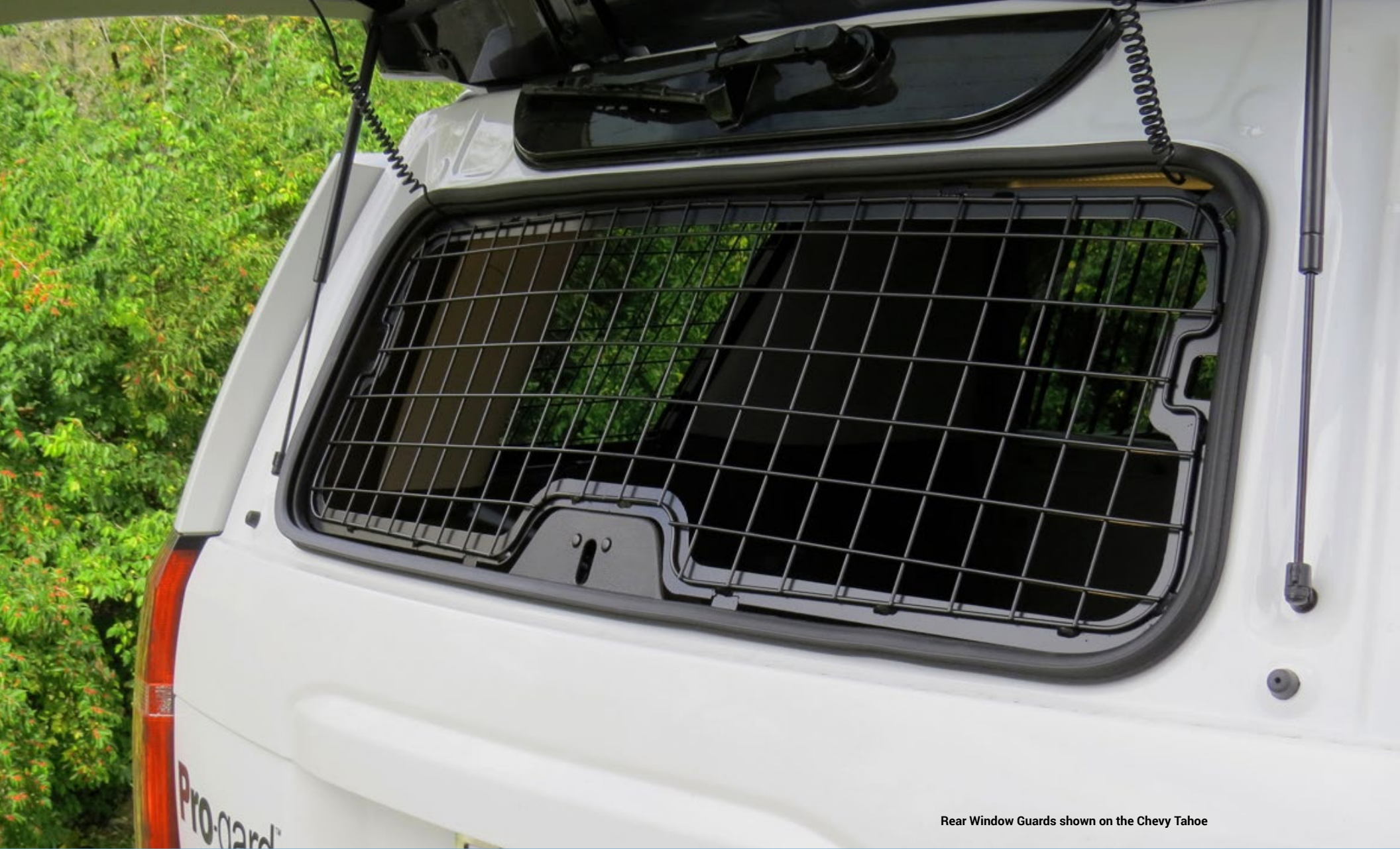
Rear Window Guards shown on the Chevy Tahoe