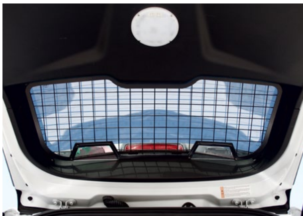
Shown inside the Ford Police Utility Interceptor

Our Rear Window Guards are the perfect theft deterrents for the cargo area in SUVs. Today's SUV with the wrap-around style window design leaves equipment, electronics and duty gear highly visible. Our product adds a layer of protection to the vehicle while enhancing officer safety.