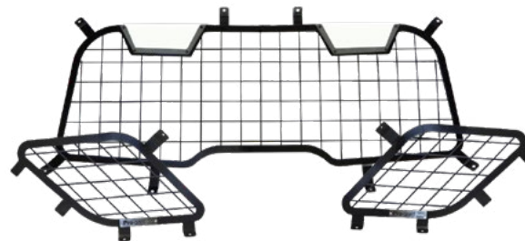
Rear Window Guard set for the Ford Police Utility Interceptor