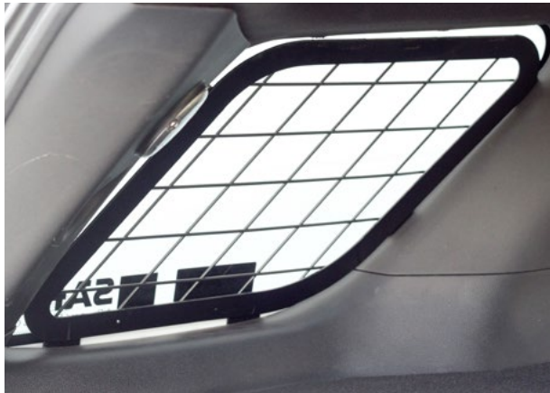
Shown inside the Ford Police Utility Interceptor