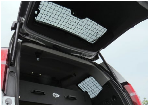
Shown in the Chevy Tahoe