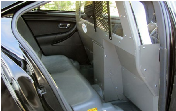
Space Saver Plus shown in the Ford PI Sedan