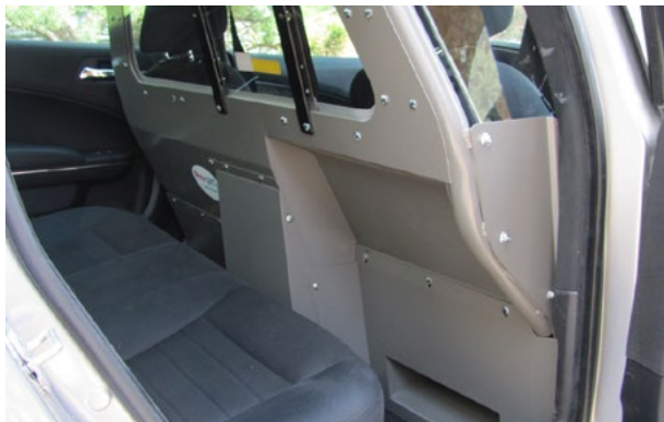
Space Saver Plus shown in the Chevy Tahoe