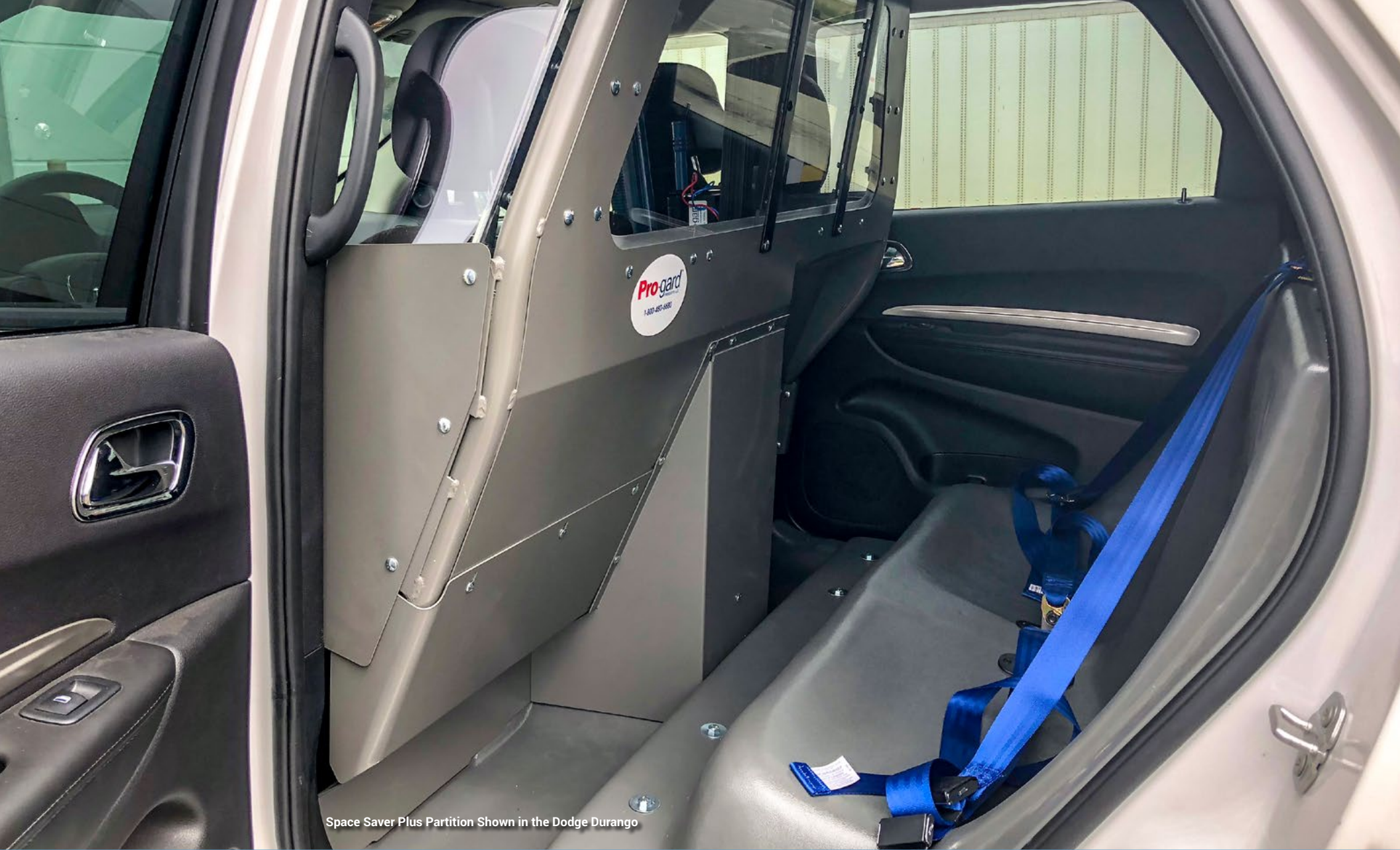
Space Saver Plus Partition Shown in the Dodge Durango