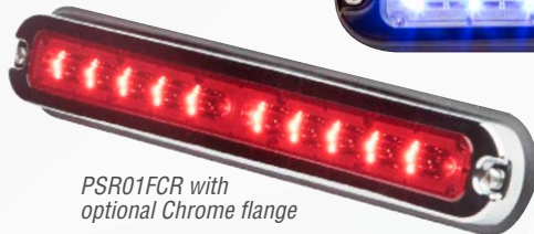
PSR01FCR with optional Chrome flange